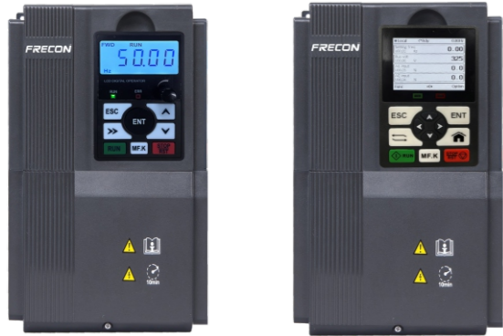
Simple LCD Keyboard